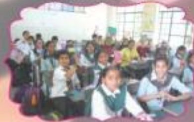
SPiC & SPAN CLUB