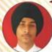
Yarnz-XI-A (Financial Assistant)