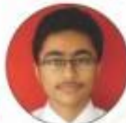
Poojanvi-XI-A (Hindi Reporter)