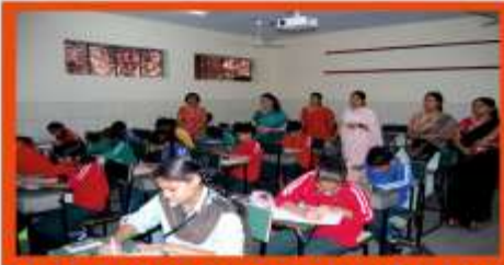
SPIC AND SPAN CLUB