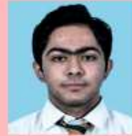
SHASHANK INFO PRAC-(100)