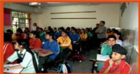
READERS' HIVE CLUB